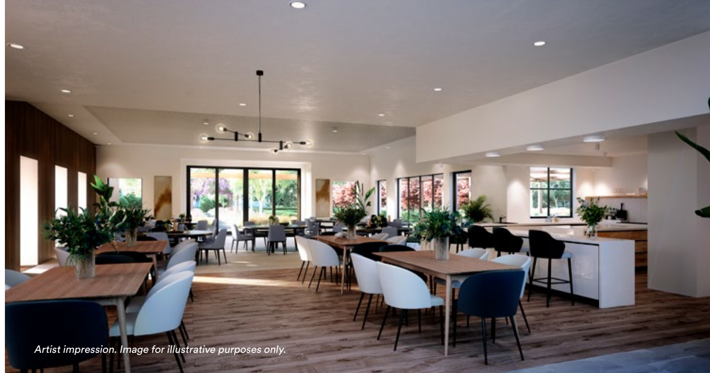
Artist impression. Image for illustrative purposes only.

The 5-star, resort-style facilities in our communities are exclusive to our homeowners and their guests. You have 24/7 access to a bowling green, indoor heated pool and spa, fully equipped gym, big-screen private cinema, lounge with computer access and free WiFi, billiards room, croquet court, pickleball court, community bus, electric car, outdoor entertainment terrace with BBQ area and a multi-million-dollar Clubhouse! There is even a dogwash and park for your pets.