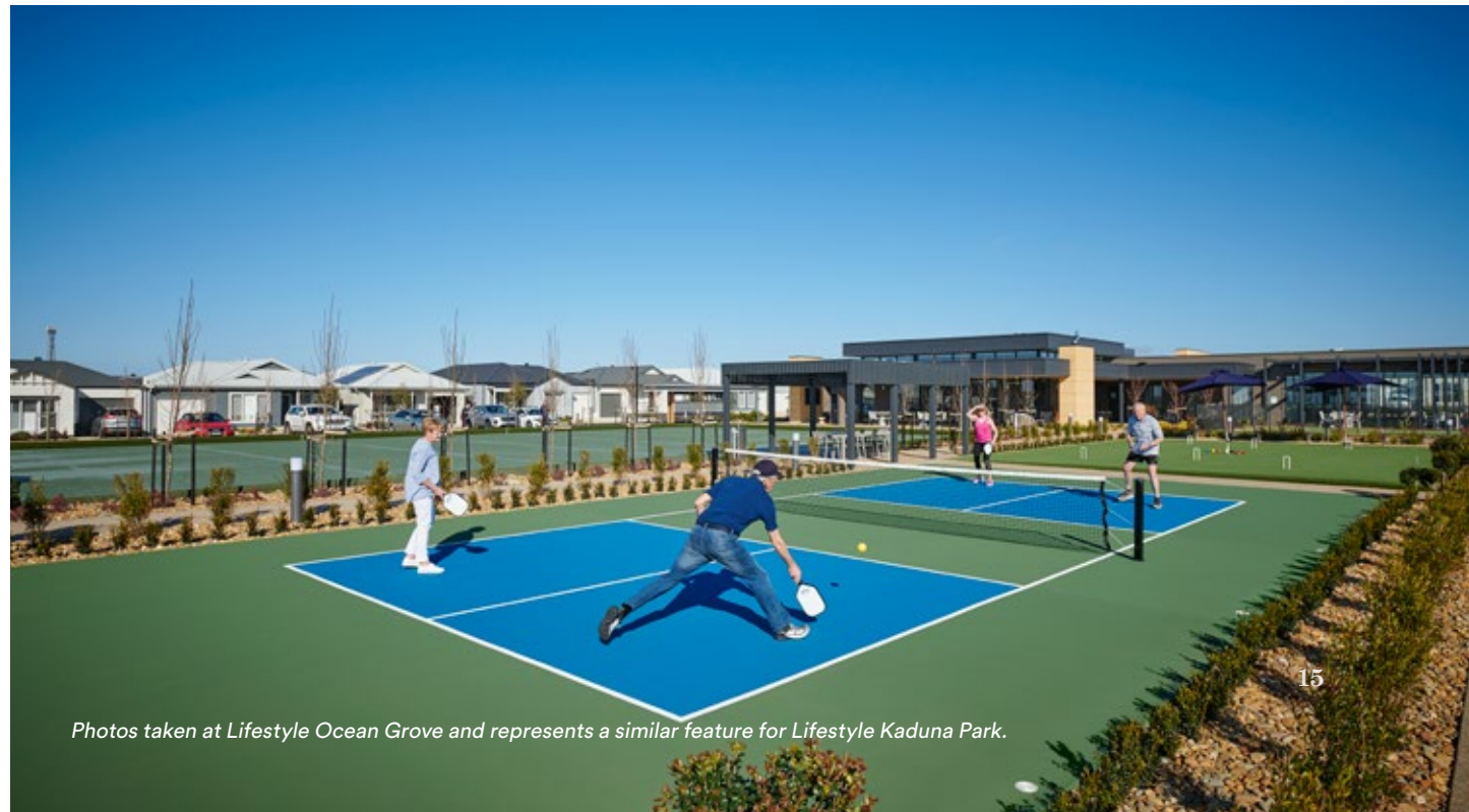
Photos taken at Lifestyle Ocean Grove and represents a similar feature for Lifestyle Kaduna Park.