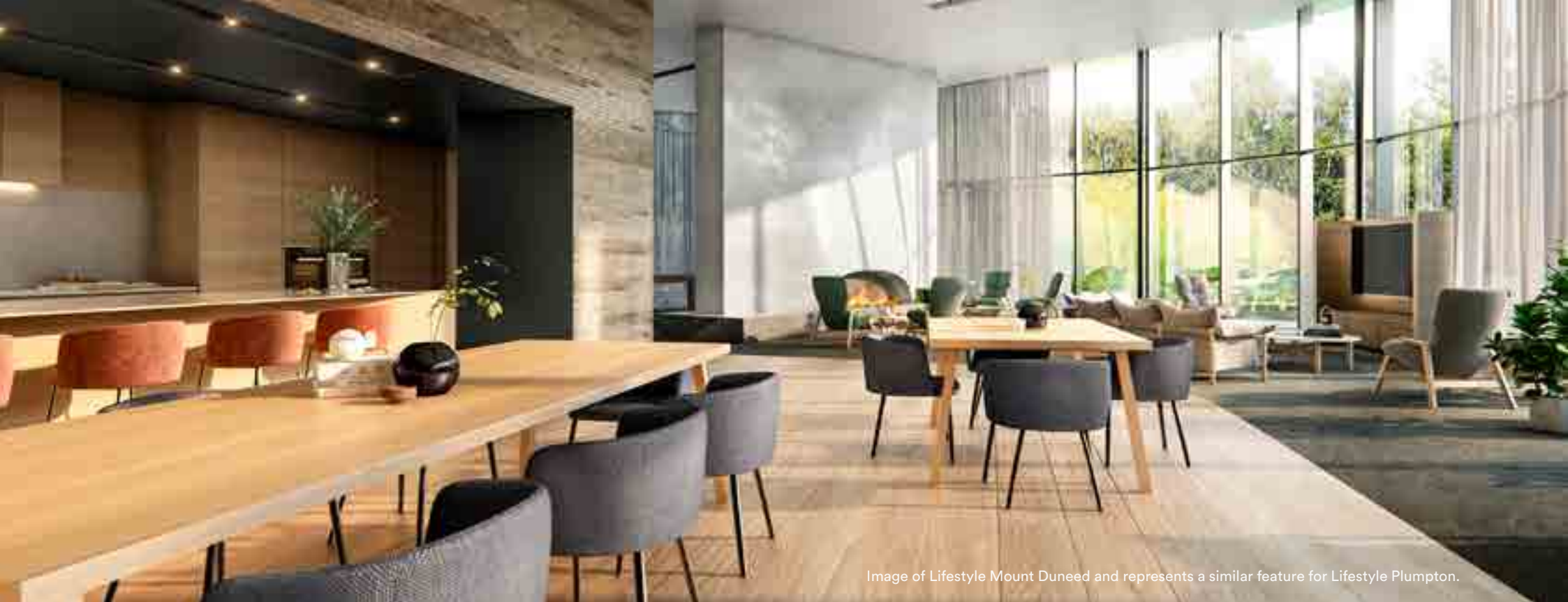
Image of Lifestyle Mount Duneed and represents a similar feature for Lifestyle Plumpton.

Enjoy everything from a stunning exterior to a safe interior