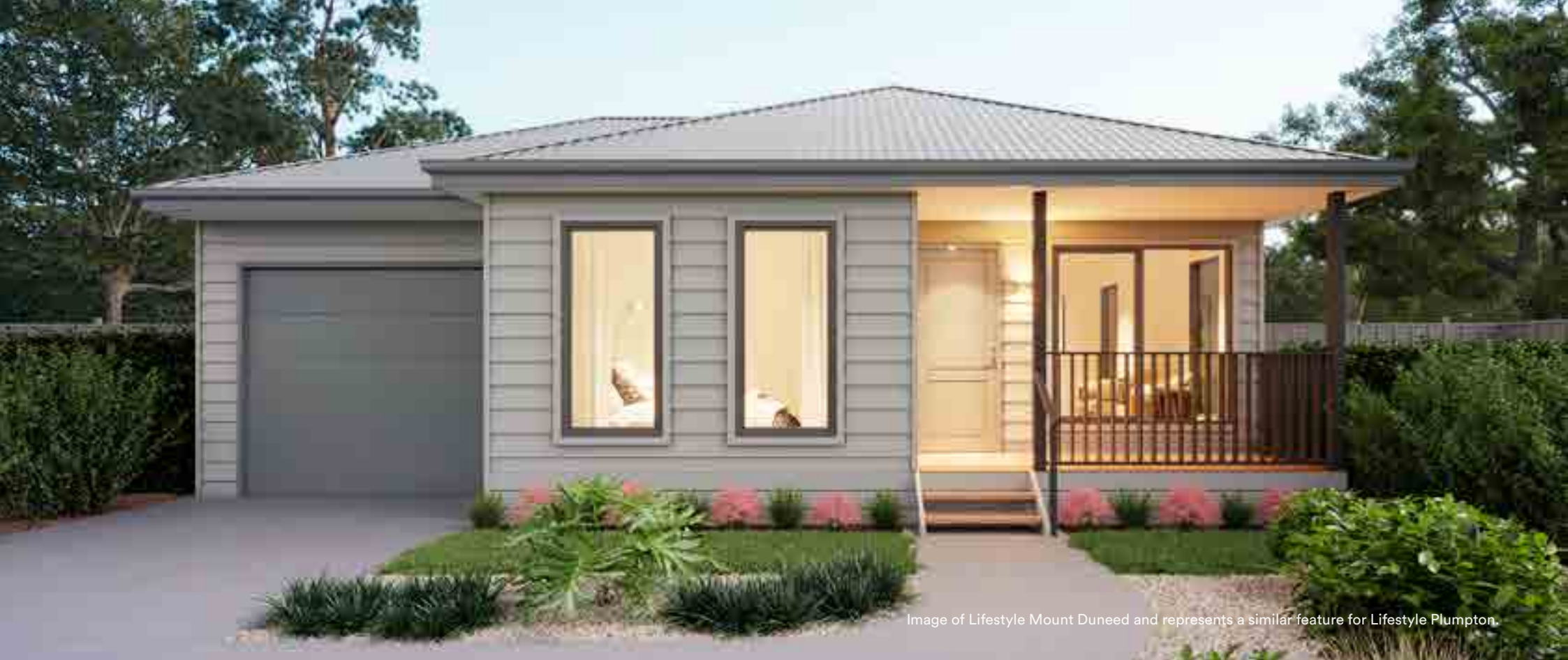
Image of Lifestyle Mount Duneed and represents a similar feature for Lifestyle Plumpton.