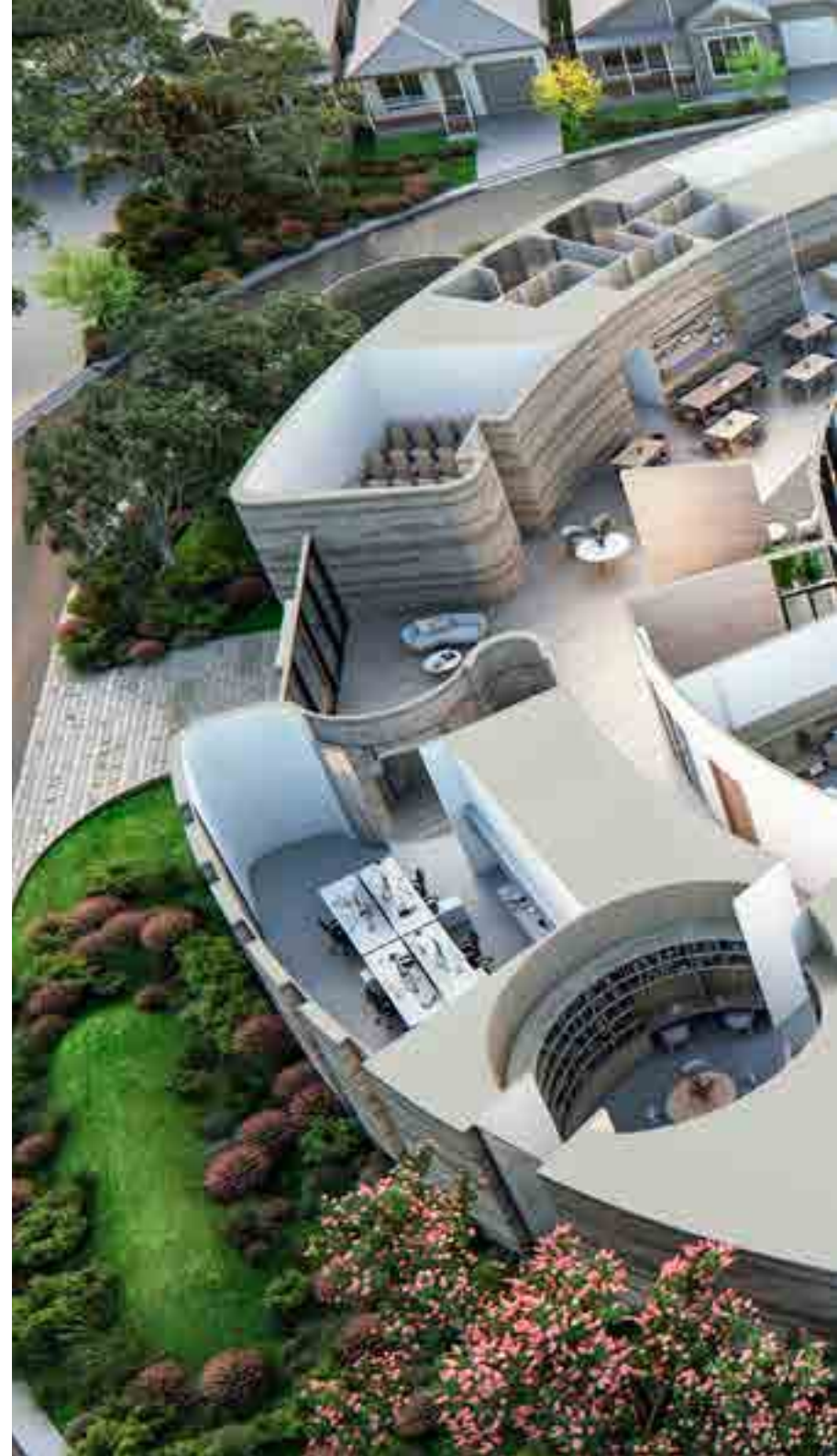
Image of Lifestyle Mount Duneed and represents a similar feature for Lifestyle Plumpton.

cellar door, 5mins away. Four: the city is only a 40min drive. Five: there are three excellent golf courses within cooee. So, eat that chocolate cake, buy that jacket, go to that open-garden, and play those eighteen holes. But before you do, move to Lifestyle Plumpton!