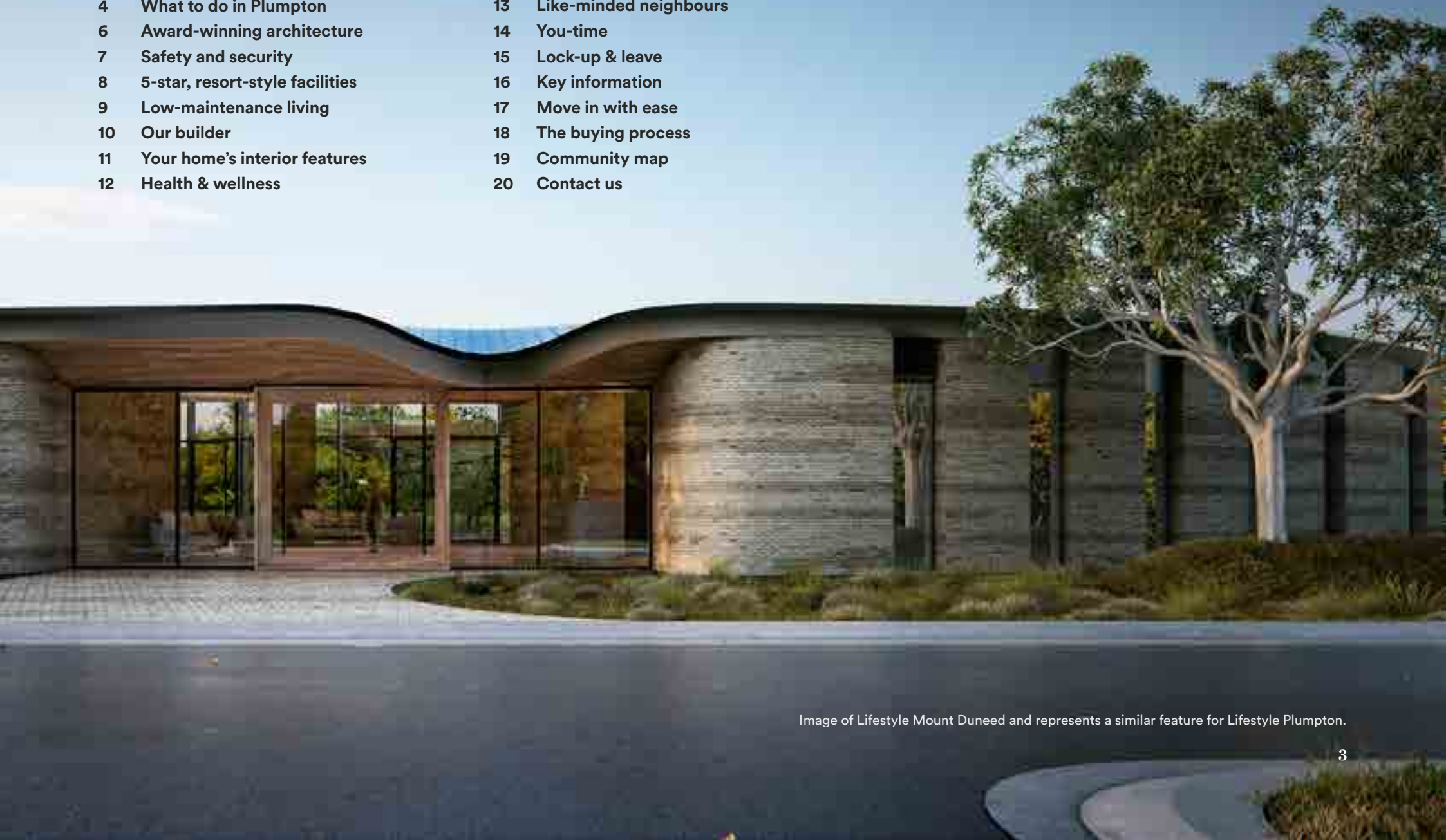
Image of Lifestyle Mount Duneed and represents a similar feature for Lifestyle Plumpton.