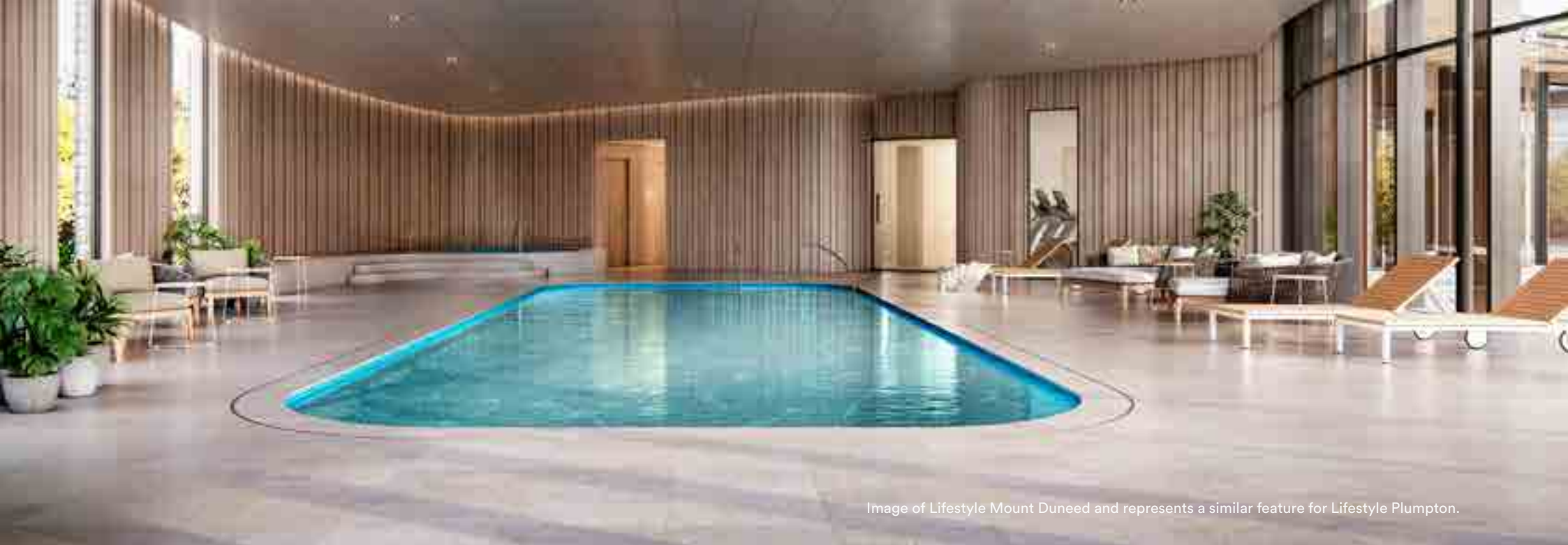
Image of Lifestyle Mount Duneed and represents a similar feature for Lifestyle Plumpton.

We've got everything from easy-care shrubbbery to 5-star luxury