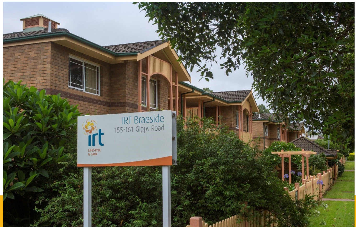
Top left - Relax in our landscaped gardens.