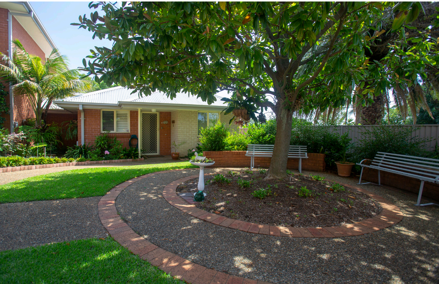
Top left - Enjoy a BBQ with family or friends. Top right - Join our boutique community of like-minded people over the age of 55. Bottom - Relax in the shade or soak up the sun in our outdoor areas.