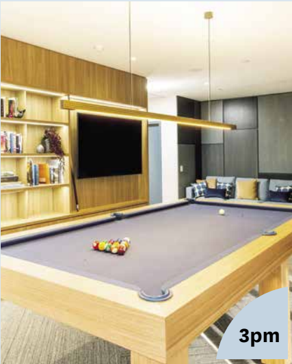
Head to The Clubhouse and meet up with like-minded people over a game of billiards