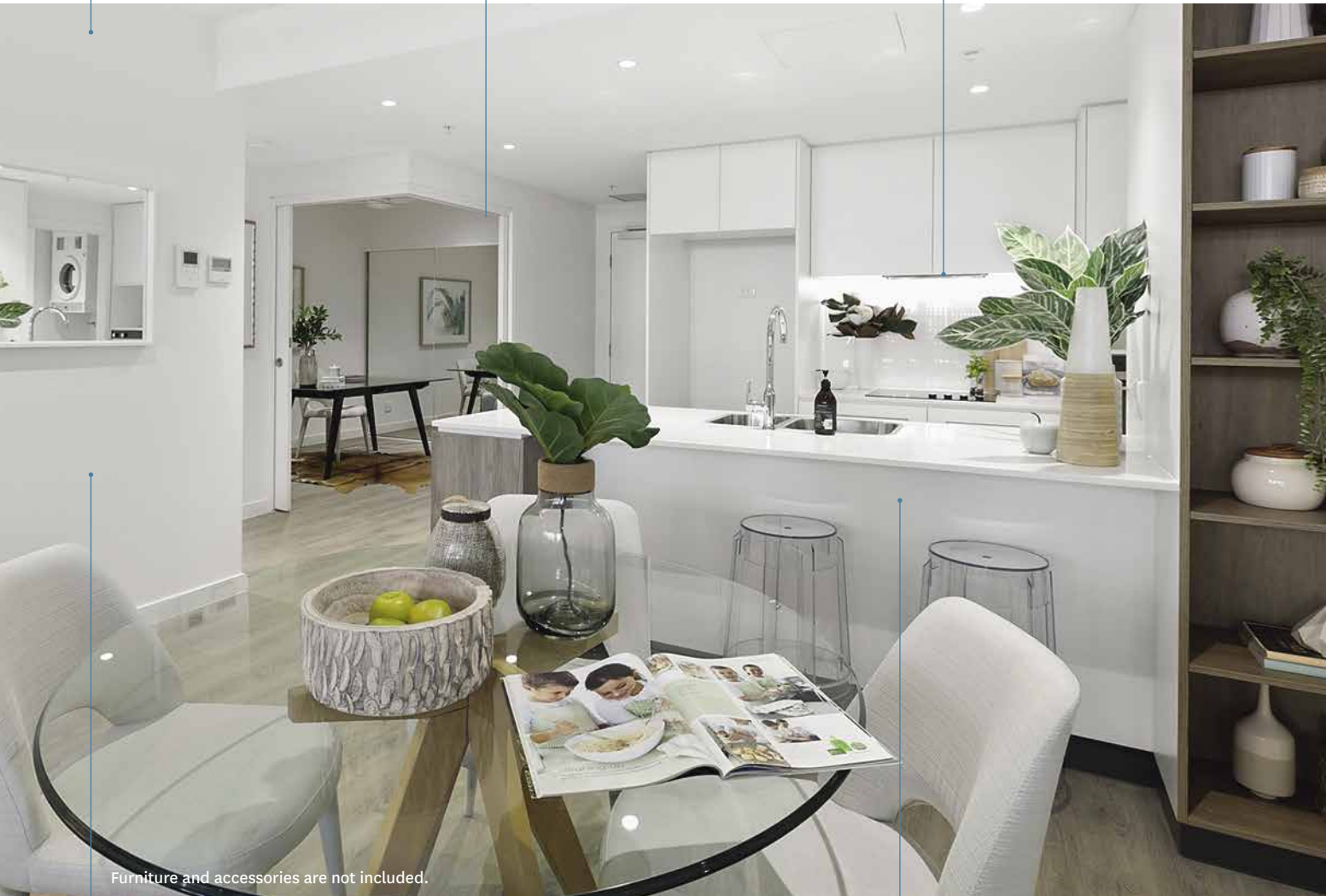
Furniture and accessories are not included.

All kitchen exhausts discharge externally to improve air quality in kitchen.