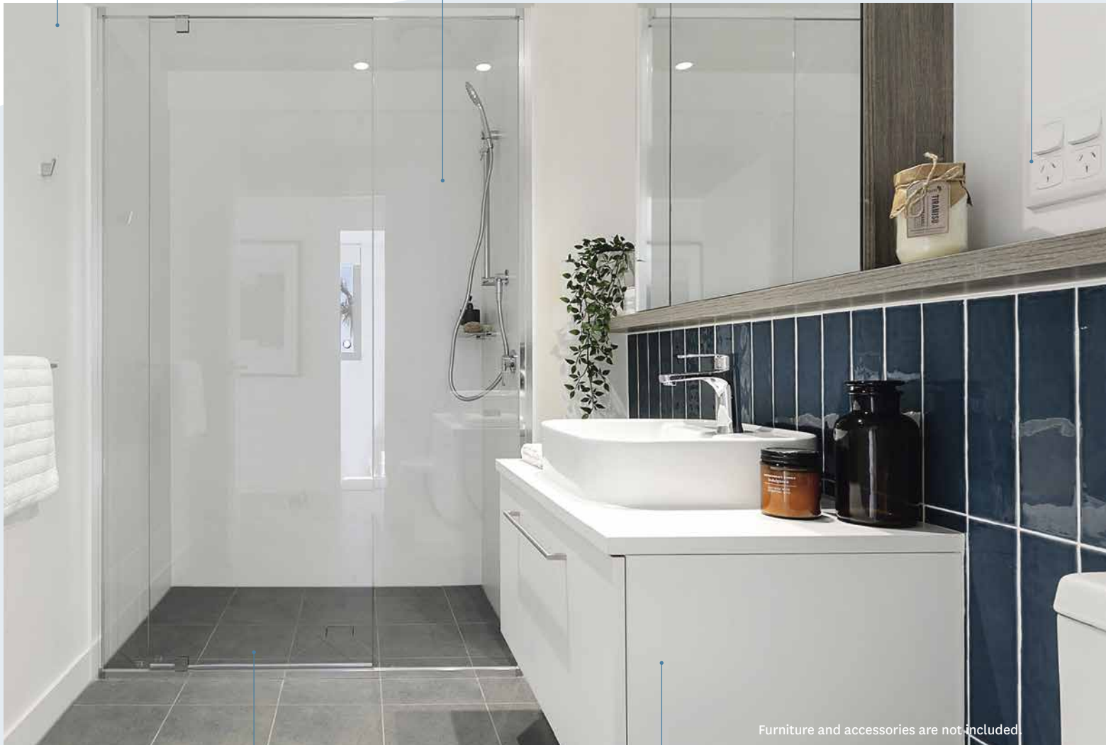
Furniture and accessories are not included.

Large sensibly located light switches and power points are installed throughout the apartment.