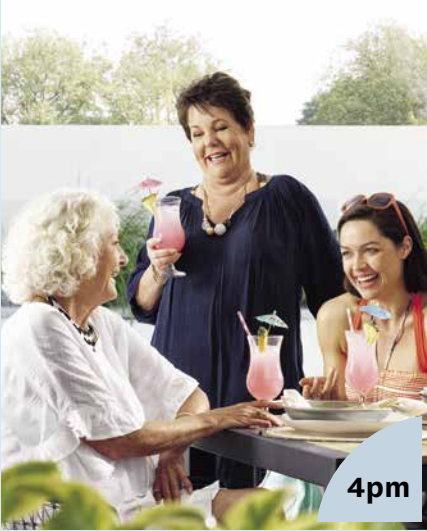
Relax and take time with friends while enjoying happy hour at The Clubhouse