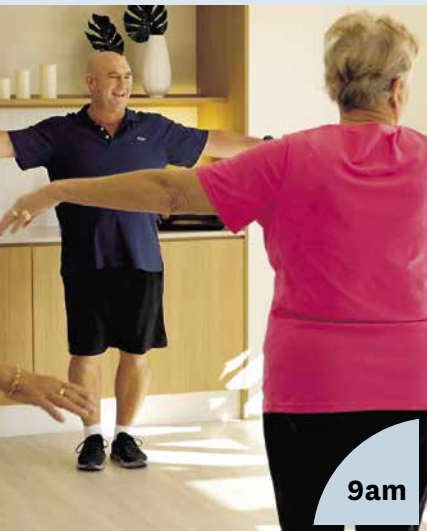
Take up a fitness class offered at the modern onsite gym