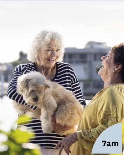
Breathe in the fresh air and take a morning walk around the lake