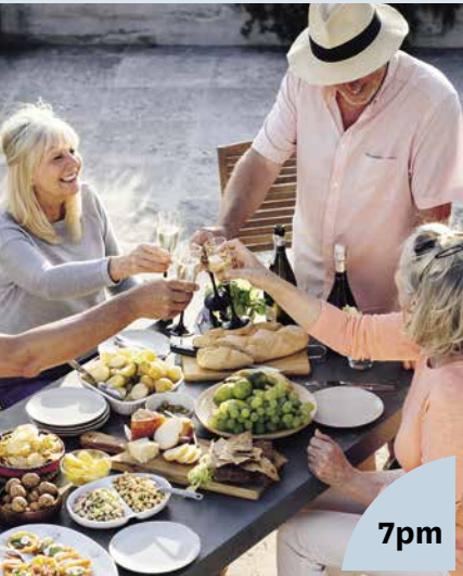
Enjoy entertaining friends in your brand new home