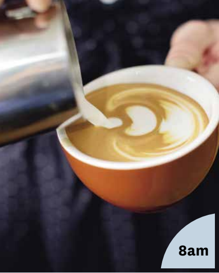
Grab a freshly ground coffee from the clubhouse lounge