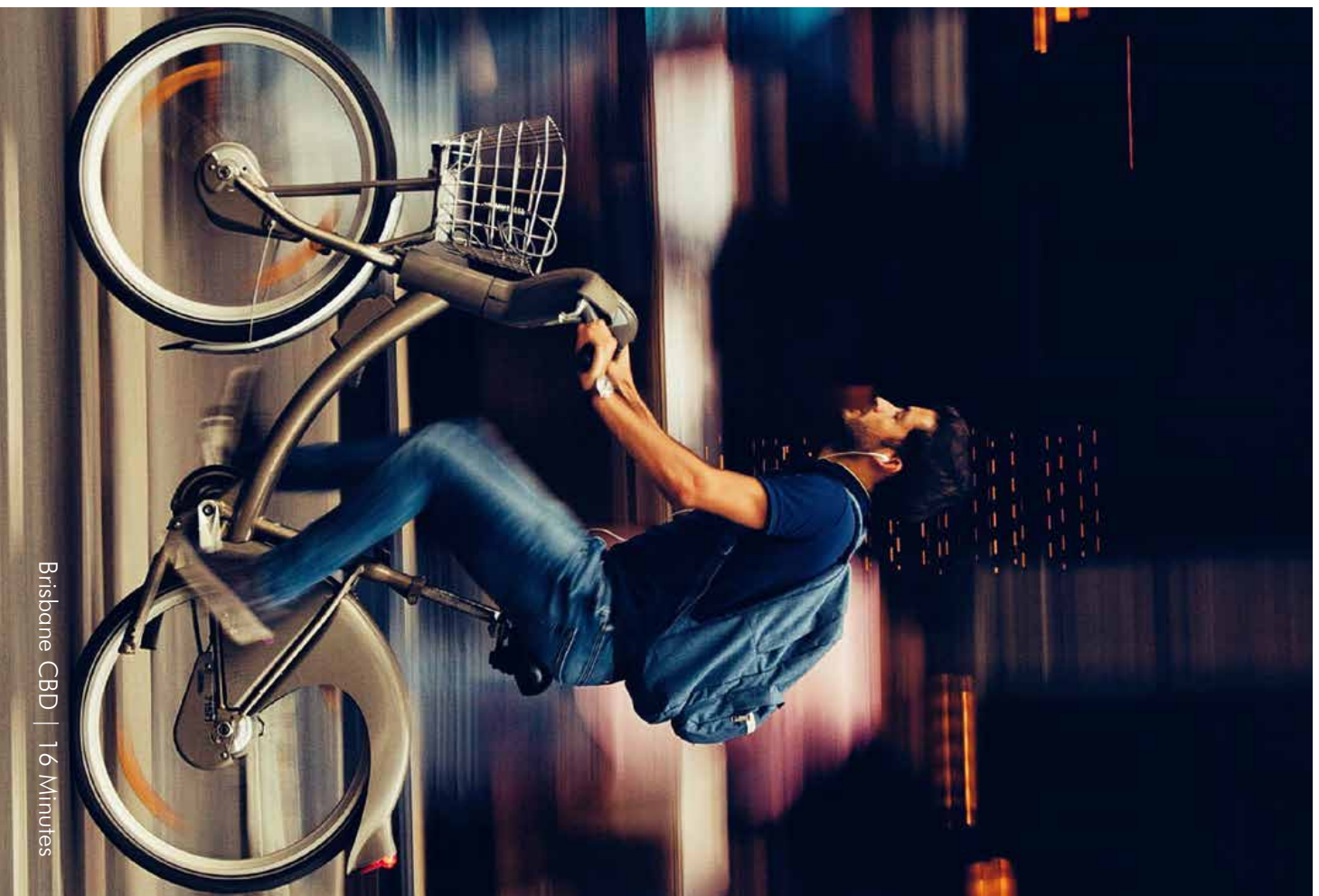
Brisbane CBD | 16 Minutes