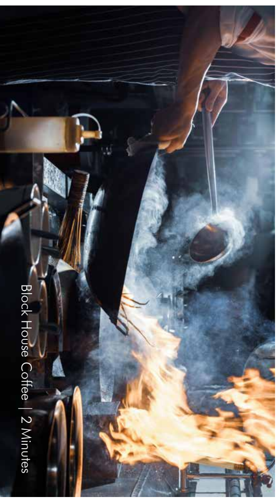
Block House Coffee | 2 Minutes