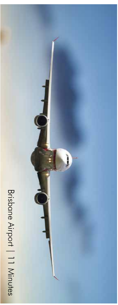
Brisbane Airport | 11 Minutes