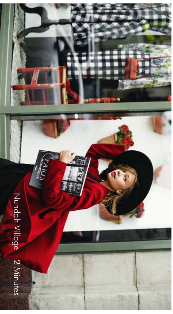
Nundah Village | 2 Minutes