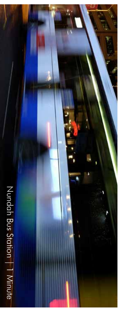
Nundah Bus Station | 1 Minute