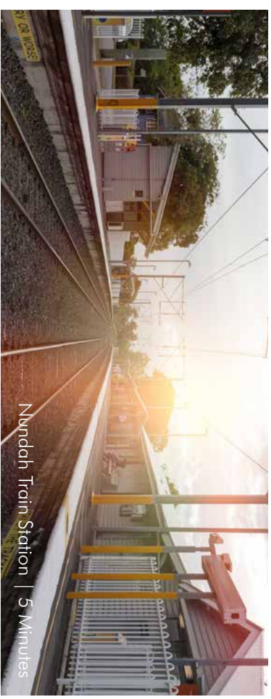
Nundah Train Station | 5 Minutes