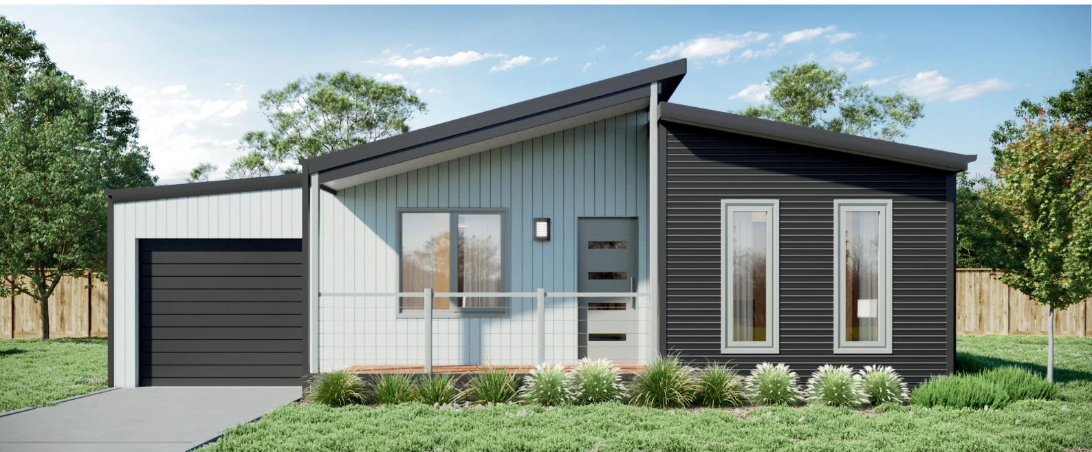
External Colourway A

The Elm features a contemporary open-plan layout that optimises living space. Its spacious lounge, kitchen, and dining area opens to an outdoor entertaining deck. This elegant home includes a main bedroom complete with an ensuite, a second bedroom, a second bathroom, and a private study. The home also features laundry facilities, additional storage and a carport with room for one car.