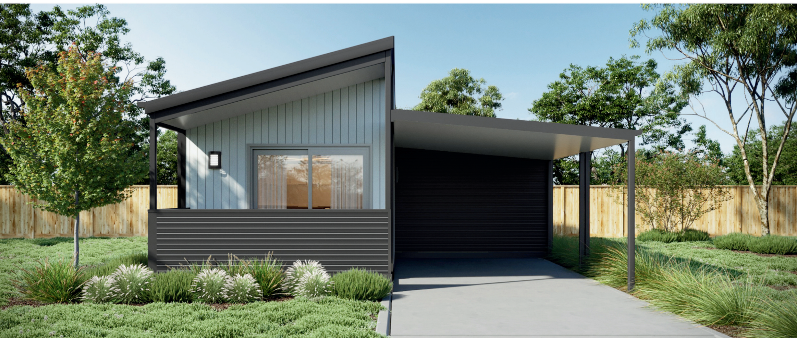
External Colourway A

The Croft provides you with an ideal low-maintenance lifestyle. Its open-plan layout features a comfortable lounge and dining area that blends seamlessly with a contemporary kitchen. The two bedrooms come equipped with built-in wardrobes and are complemented by a large family bathroom that includes a compact laundry and linen cupboard. The home also offers a charming front porch and a single-car carport.