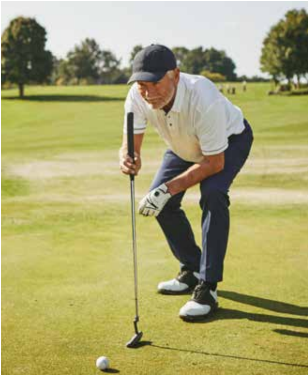
Swing into easy living with Camden Golf Club across the road.