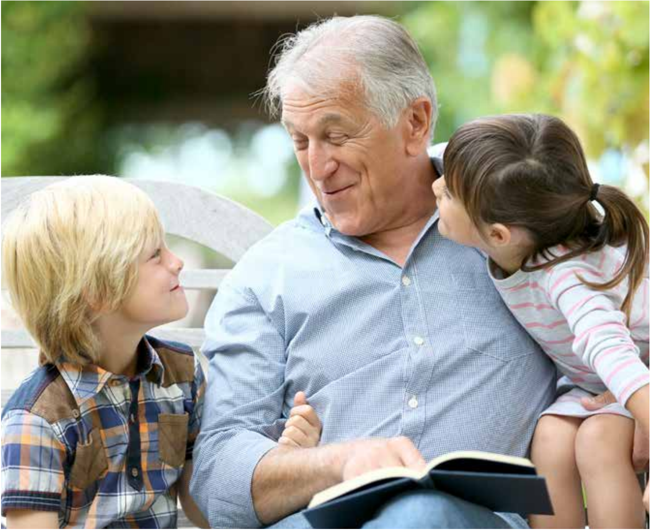
Enjoy quality time with family and friends.