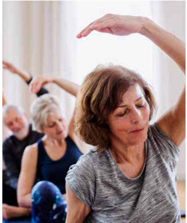
Stretch, strengthen and restore in our yoga sessions.