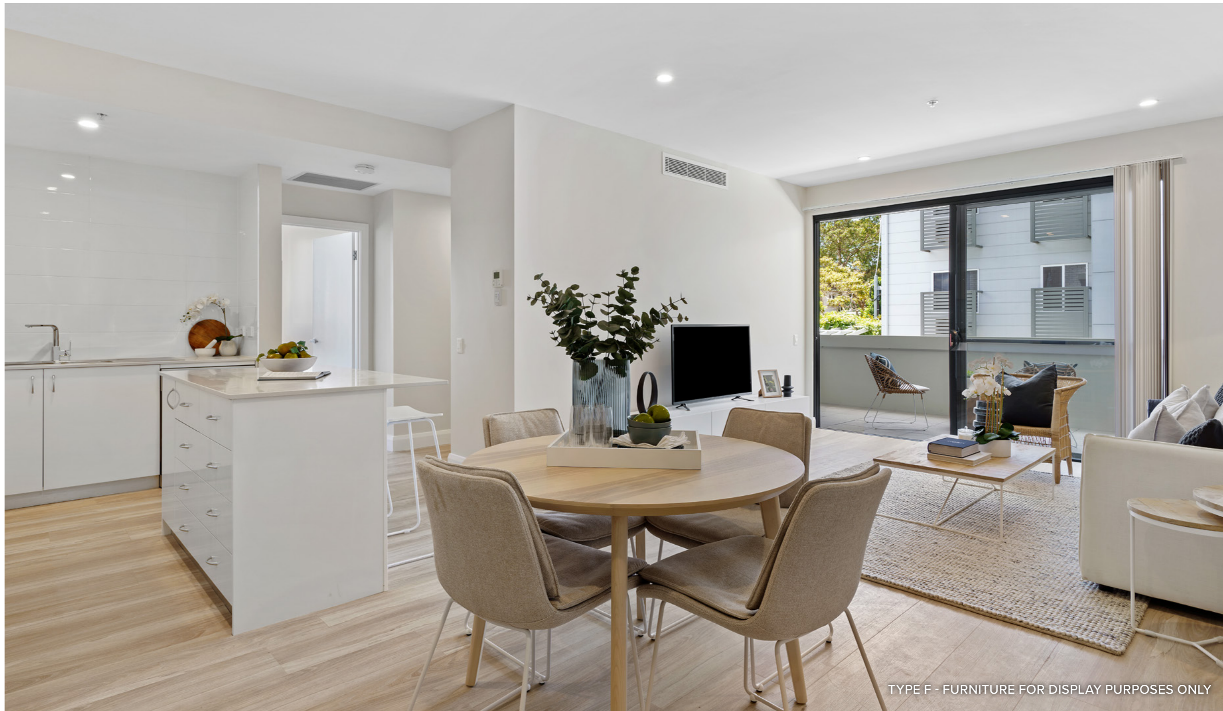
TYPE F - FURNITURE FOR DISPLAY PURPOSES ONLY