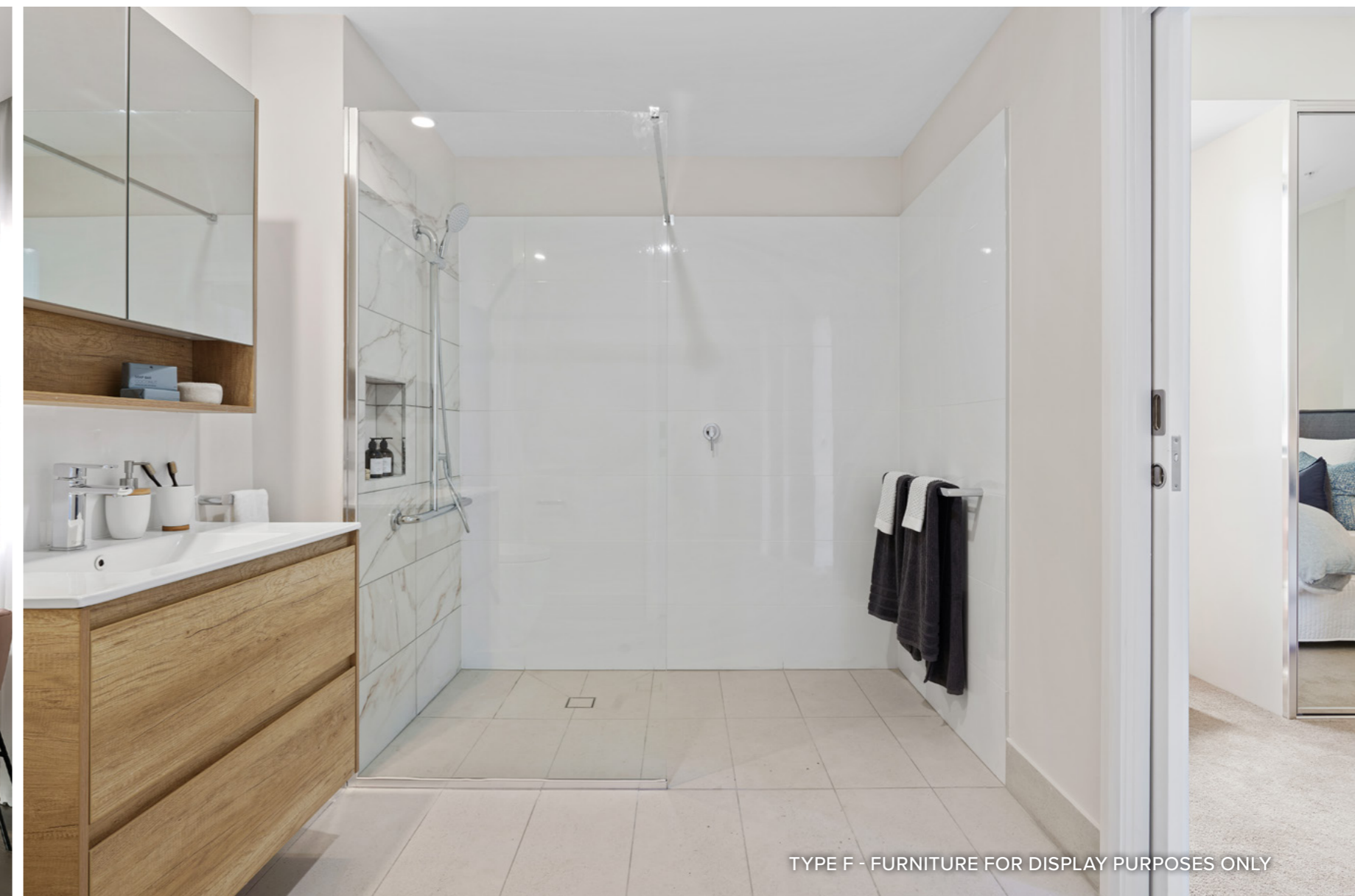
TYPE F - FURNITURE FOR DISPLAY PURPOSES ONLY