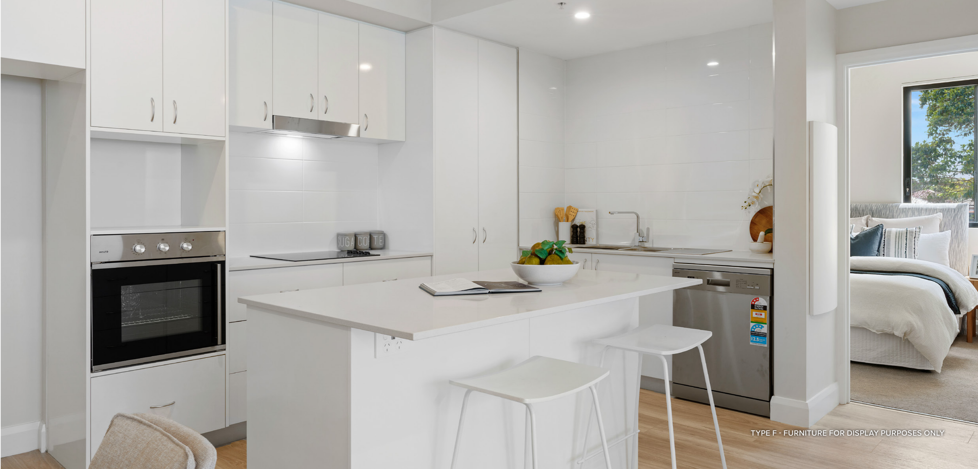
TYPE F - FURNITURE FOR DISPLAY PURPOSES ONLY