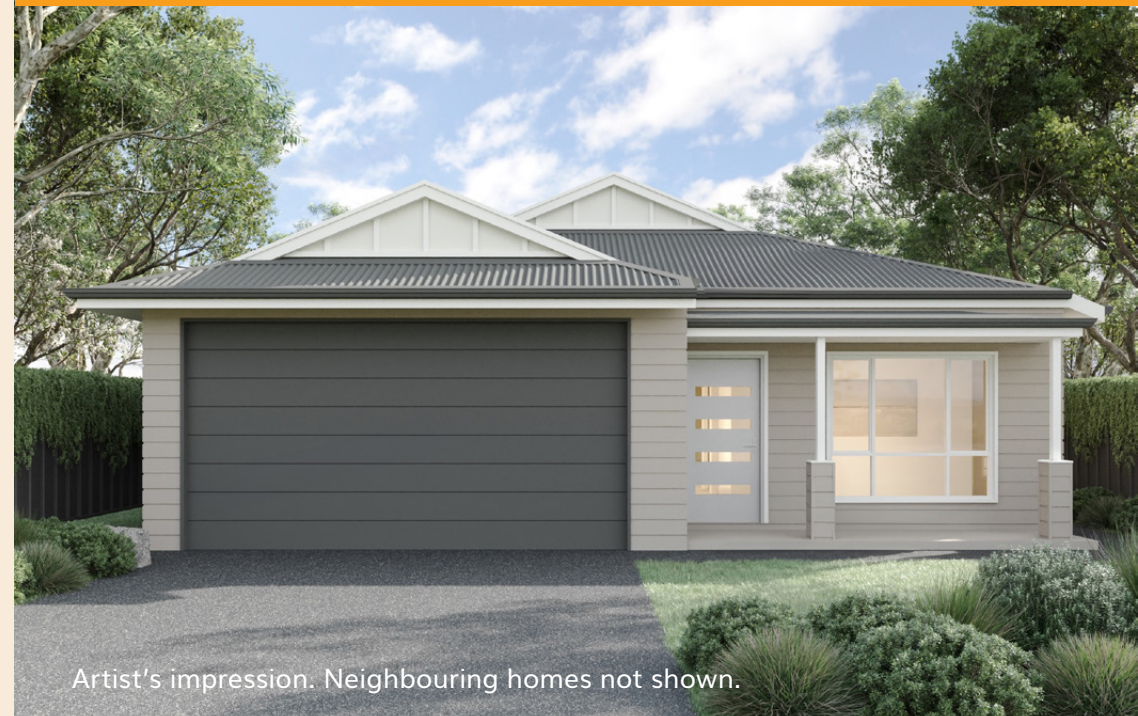
Artist's impression. Neighbouring homes not shown.