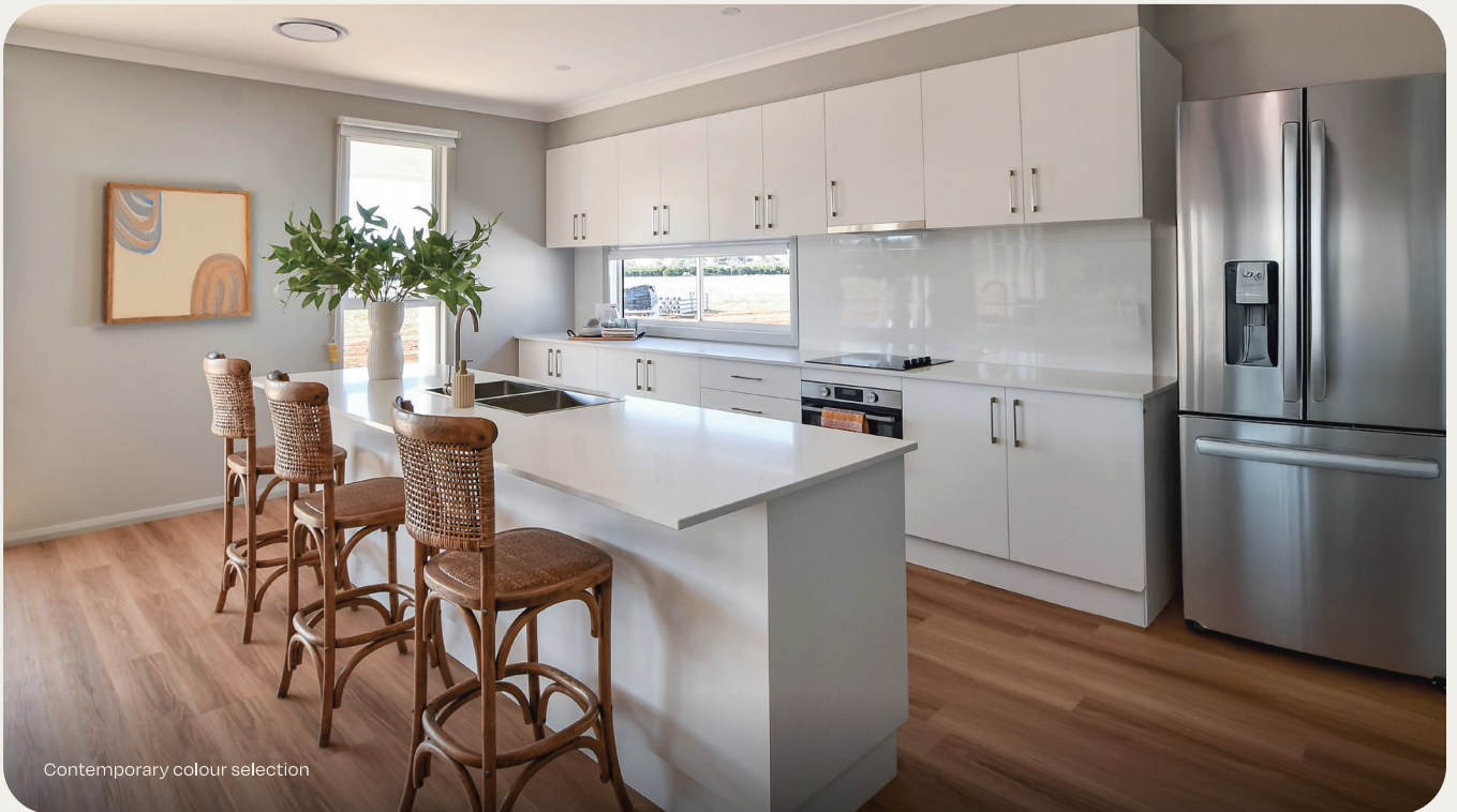
Contemporary colour selection