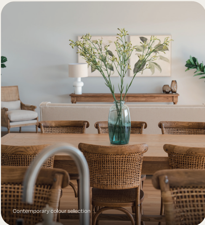
Contemporary colour selection