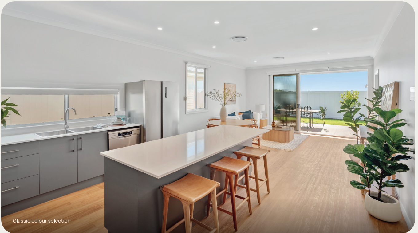
Classic colour selection