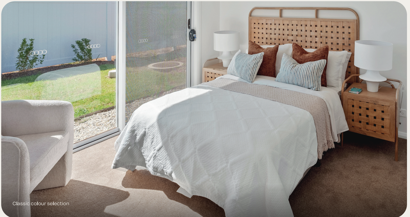
Classic colour selection